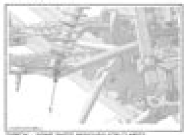
FIGURE 11. BALL AND NUT REMOVAL FROM SHOCK

8. Remove ball and nut securing suspension arm to shock absorber.