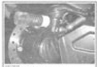
FIGURE 10. BALL JOINT NUT AND WASHER REMOVAL

WARNING Never hit on suspension arm to avoid to damage it permanently.