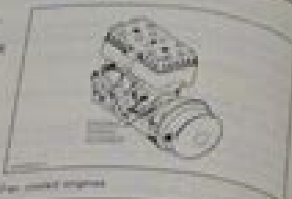
Engine and transmission