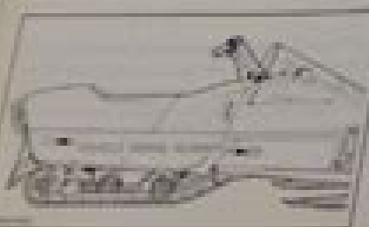
The engine and transmission number.