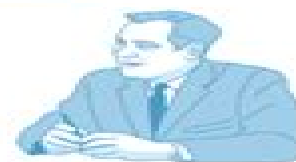
Joseph F. Sutter Designer of the 747 Series.

The 747-400 is the most advanced aircraft in the world. It has the highest payload capacity, the highest cruise speed, and the highest ceiling of any aircraft in the world. It is the only aircraft in the world that can fly non-stop from Los Angeles to London.