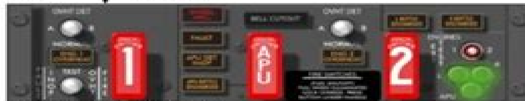
Engine and APU Fire Control Panel (P8)