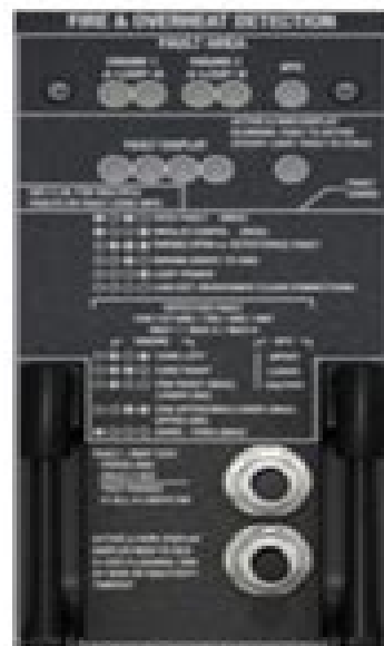
Fire Detection Control Unit