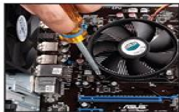
4 Mount the CPU cooler