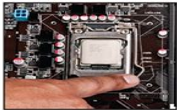
3 Install the CPU