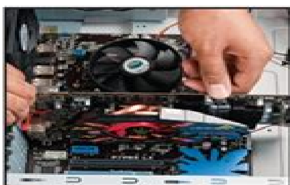
8 Install the graphics card