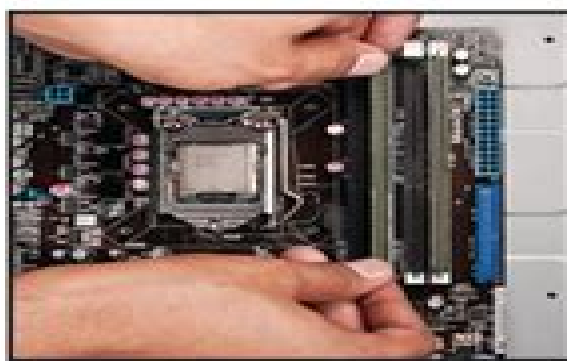
5 Install the RAM