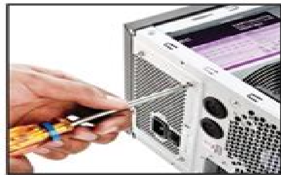
1 Install the power supply