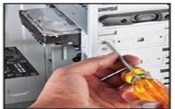
6 Install the hard drive