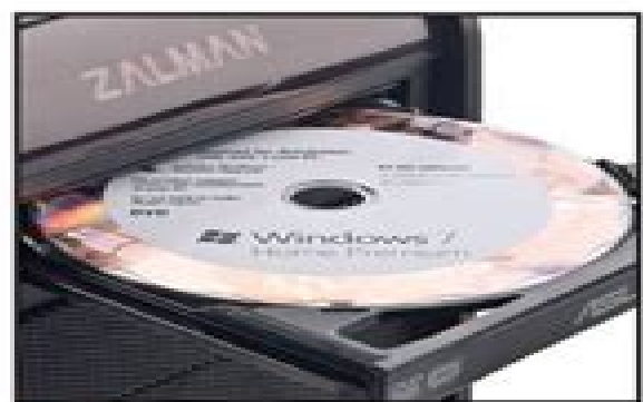
9 Install the operating system