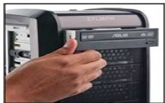
7 Install the optical drive