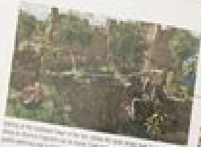
This is the main island of the game. It is a large, lush island with a dense forest of tall trees. The island is surrounded by a small body of water and is the main focus of the game.