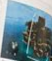
This is the location of the lighthouse. It is a small, white, circular structure that is used to guide ships at night. It is located on the northwest coast of the island.