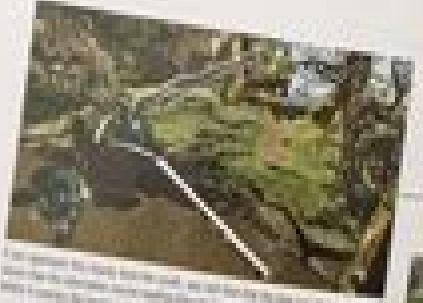
This is the location of the lighthouse. It is a small, white, circular structure that is used to guide ships at night. It is located on the northwest coast of the island.