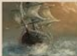
7 Chapter Seven: Voyages