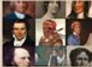
1 Chapter One: Revelations

The sixty years between 1800 and 1860 saw the politics, religion, language, literature, art, population, and economy of the young United States change with remarkable speed, forever shaping American history. To help see the variety and depth of those changes, this StoryMap offers a geographic and chronological map of the era, connecting to helpful websites, a traveling that explores places today, and learning resources for use in classes. It presents portraits and images of people who confronted the challenges and opportunities of these critical decades of American history. The stories of those people and of this time are explored in the book that inspired this project: American Visions: The United States, 1800–1860 , by Edward L. Ayers.