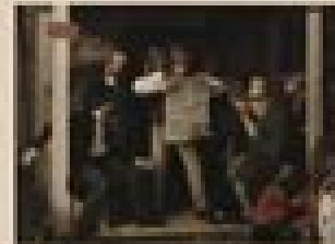
5 Chapter Five: Explorations