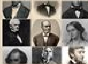
4 Chapter Four: Reflections