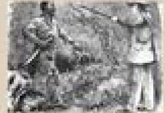
3 Chapter Three: Rebellions