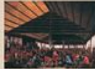
2 Chapter Two: Reckonings