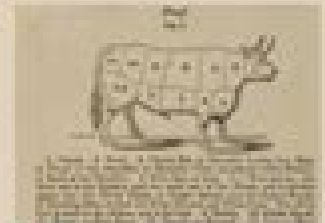
6 Chapter Six: Boundaries