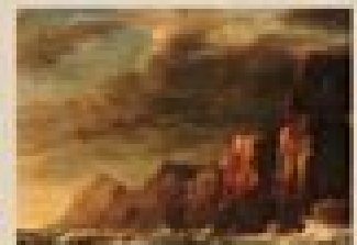
9 Chapter Nine: Culminations