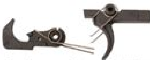
Proper hammer and trigger spring installation

The Disconnecter Spring is installed with the flared end down.