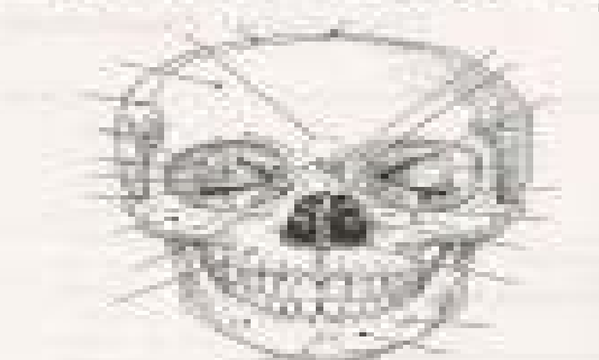
Fig. 1. Superior view of the skull of a human. Fig. 2. Inferior view of the skull of a human. Fig. 3. Lateral view of the skull of a human. Fig. 4. Medial view of the skull of a human. Fig. 5. Anterior view of the skull of a human. Fig. 6. Posterior view of the skull of a human. Fig. 7. Superior view of the skull of a chimpanzee. Fig. 8. Inferior view of the skull of a chimpanzee. Fig. 9. Lateral view of the skull of a chimpanzee. Fig. 10. Medial view of the skull of a chimpanzee. Fig. 11. Anterior view of the skull of a chimpanzee. Fig. 12. Posterior view of the skull of a chimpanzee.