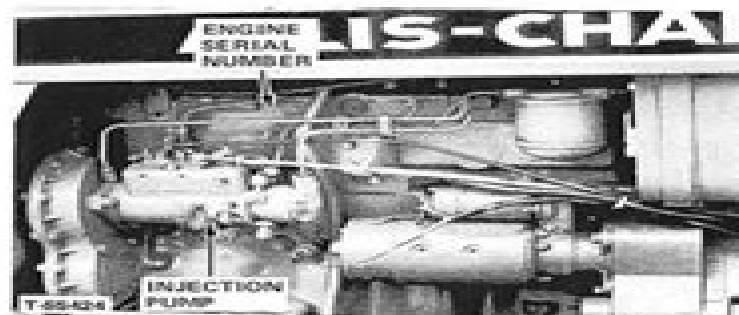
FIGURE 2A - Left Hand Side (Diesel)