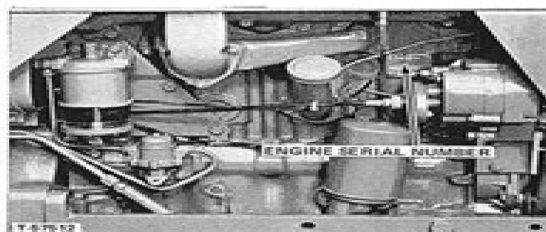
FIGURE 2 - Right Hand Side (Diesel)

On some diesel engines the serial number is stamped on the front left hand side of the cylinder block above the injection pump. Example: LD 1234S N 1234S E or LD A1234 N 1234S E. (Figure 2A).