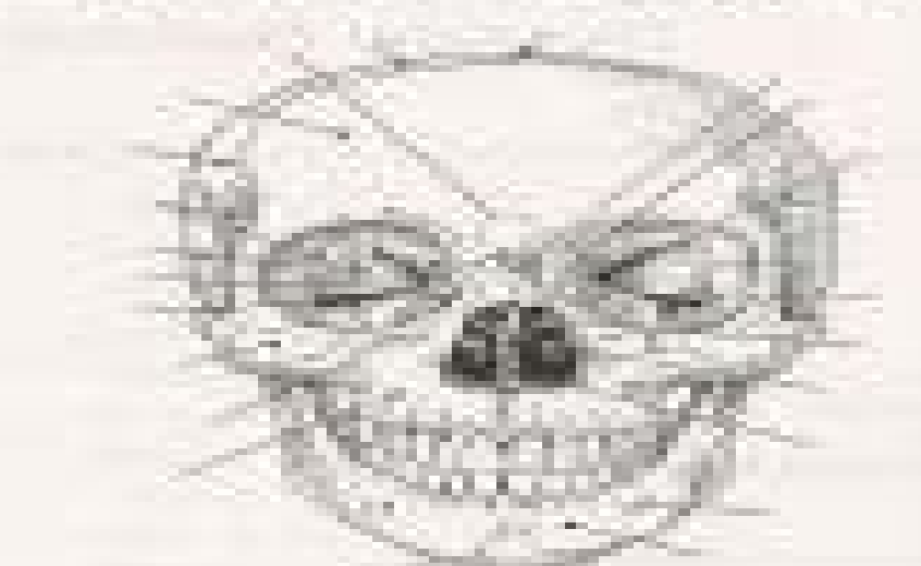
Fig. 1. Superior view of the skull of a human. Fig. 2. Inferior view of the skull of a human. Fig. 3. Lateral view of the skull of a human. Fig. 4. Medial view of the skull of a human. Fig. 5. Anterior view of the skull of a human. Fig. 6. Posterior view of the skull of a human. Fig. 7. Superior view of the skull of a chimpanzee. Fig. 8. Inferior view of the skull of a chimpanzee. Fig. 9. Lateral view of the skull of a chimpanzee. Fig. 10. Medial view of the skull of a chimpanzee. Fig. 11. Anterior view of the skull of a chimpanzee. Fig. 12. Posterior view of the skull of a chimpanzee.