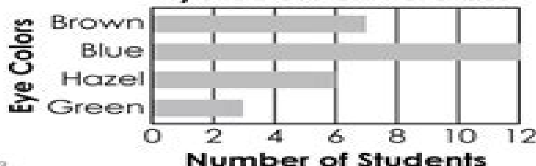
Eye Colors of the Class

19. Ally has 8 grapes. She eats 3. Then she gives 2 away. How many grapes does she have left?