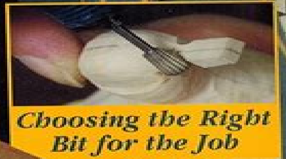
Choosing the Right Bit for the Job