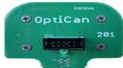
Tastkopf Siemens 201 needle Siemens 201