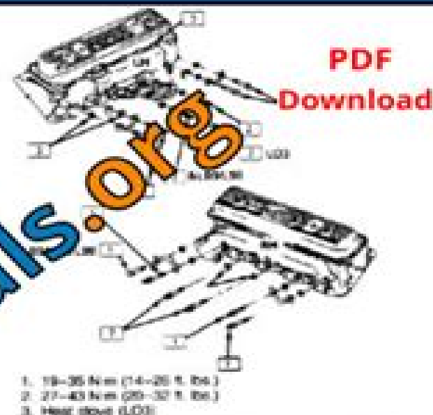
Fig. 2: Exhaust manifold bolts for most V8 engines up to 1992