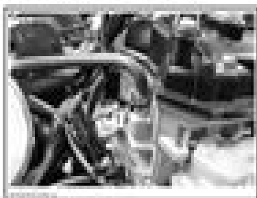
1. Loosen inlet hose clamp.