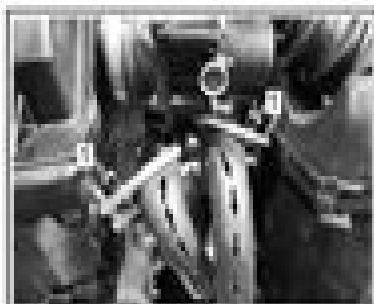
1. Unplug throttle.