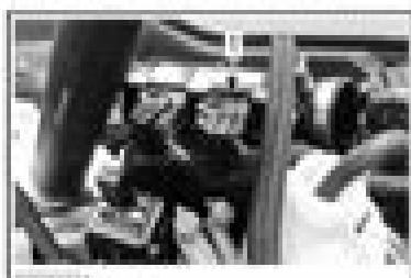
1. ECM harness.