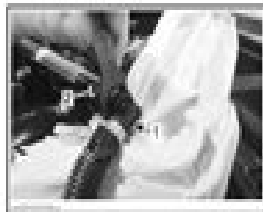
2. Cut and pull. 3. Fuel hose disconnect tool.