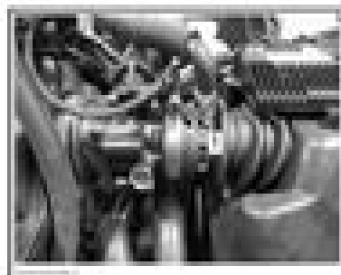
1. Loosen the clamp.