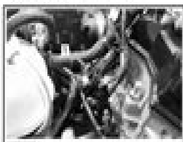
1. ECM sensor connector.