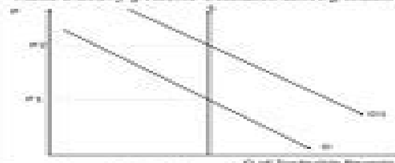
Market for Tradeable Permits, when a heavy polluter demands more permits

Question: 2. Identify a problem with a tradeable permits system.