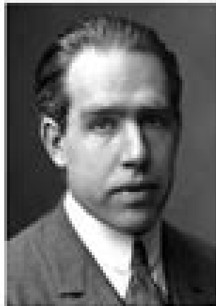
Niels Bohr (1885 – 1962)