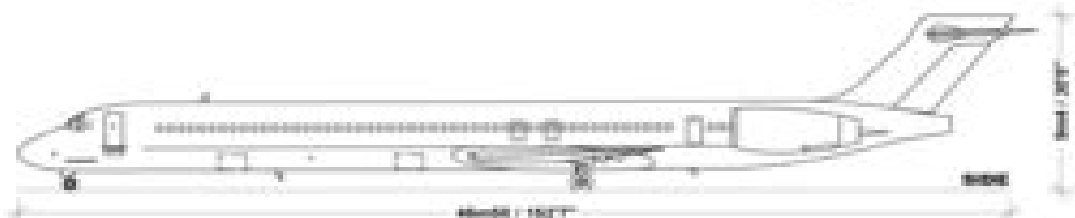
McDonnell Douglas MD90