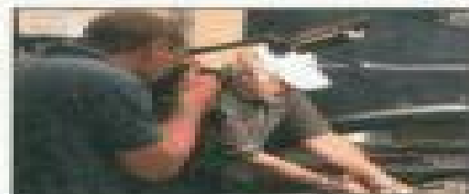
Bentley technical editors removing valve-train cover on N57 engine.

The do-it-yourself BMW owner will find this manual indispensable as a source of detailed maintenance and repair information. Even if you have no intention of working on your vehicle, you will find that reading and owning this manual makes it possible to discuss repairs more intelligently with a professional technician.