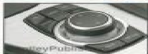
Learn how to reset condition-based service (CBS) intervals using iDrive or start switch. Gain insight into CBS Maintenance.