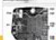
Engine compartment view, showing the oil filler cap location (R55/R56)