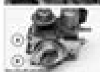
Oil filler cap location view, showing the oil filler cap location (R55/R56)