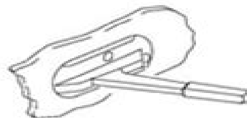
STABILIZER AND FIN CAP INSTALLATION (EXAMPLE)