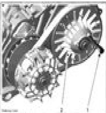
1. Drive pulley cover 2. Drive belt

To remove belt no. 4, slip the belt over the top edge of sliding belt, as shown.