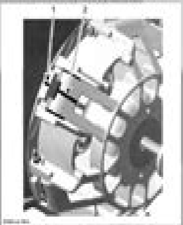
1. Drive belt 2. Drive pulley

CAUTION: Prior to removing the drive pulley, mark sliding belt and governor cup together to ensure correct reinstallation. There are only 4 ways mounted out of 8 possible positions.