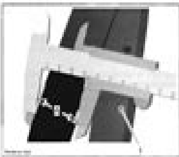
1. Drive belt 2. Drive pulley