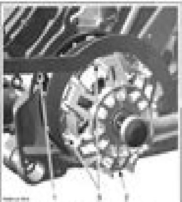
1. Drive belt 2. Drive pulley

CAUTION: Prior to removing the drive pulley, mark sliding belt and governor cup together to ensure correct reinstallation. There are only 4 ways mounted out of 8 possible positions.