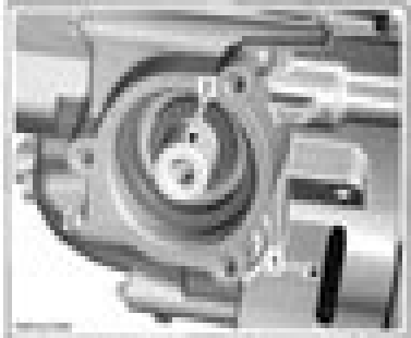
1. Drive belt 2. Drive pulley