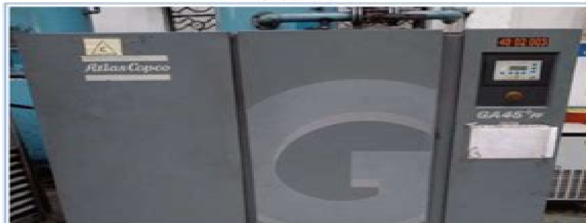
Model GA 45