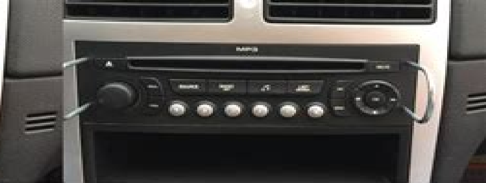
1. FOR PEUGEOT RD4 RD45 307 407 408 507 508 FOR CITROEN C2 C5 ETC