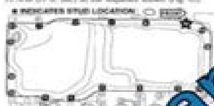
Fig. 40 Oil Pan Tightening Sequence

39e Install the oil pan. Torque the retaining bolts to 12.7Nm (10 ft. lbs.) in the torque shown (Fig. 39).