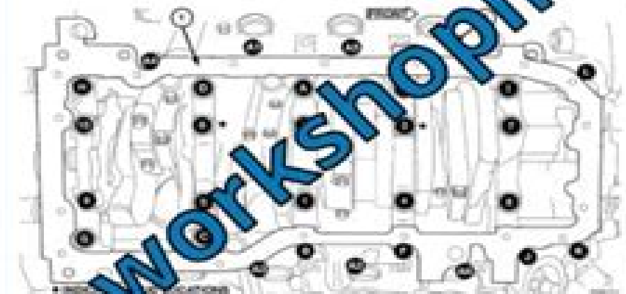
Fig. 41 Engine Tightening Sequence