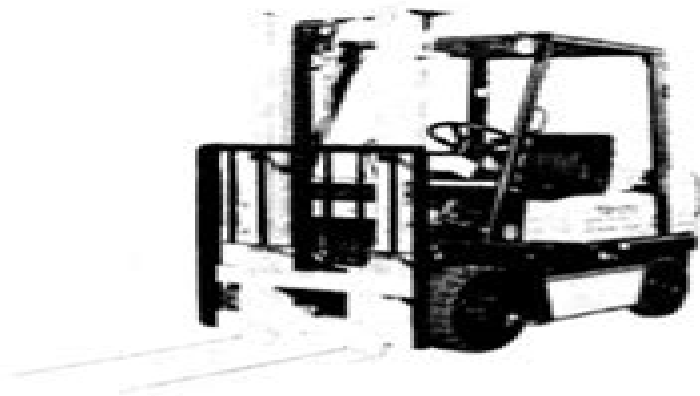
Vehicle Front View