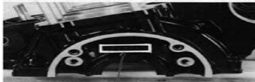
(1) I.D. CODE LETTER