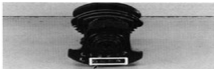
(1) O.D. CODE LETTER