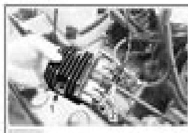
1. Disconnect inlet and outlet hoses from air filter manifold.

13. Unplug throttle sensor connector from voltage regulator.