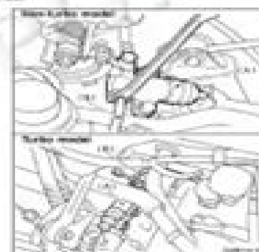
(A) Operating cylinder (B) Vinyl tube

3) Slowly depress the clutch pedal and keep it depressed. Then open the air bleeder to discharge air together with the fluid. Release the air bleeder for 1 or 2 seconds. Next, with the bleeder closed, slowly release the clutch pedal.