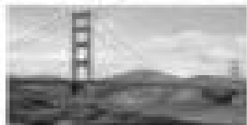
The Golden Gate Bridge

Read the selection and write the best answer to each question. Read the selection and write the best answer to each question. Read the selection and write the best answer to each question.