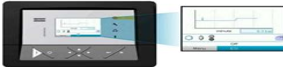
Real time trending

The superior processing capability of the Elektronikon® Mk5 enables a compressor of almost any age or type to benefit from the latest and most advanced control algorithms and functionality, resulting in improved system control and energy savings.