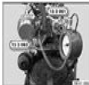
Fig. 128: Special Tool (1) (9.545) and (1) (9.545)