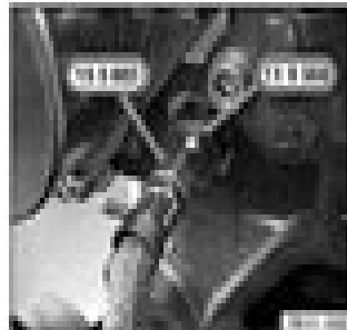
Fig. 127: Special Tool (1) (9.540) and (1) (9.545)

Check engine oil pressure with diagnostic tester.