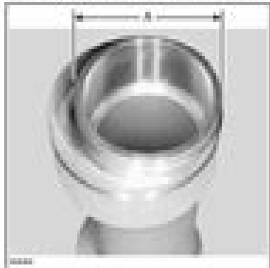
15 mm (2.05 in)

Installation is the reverse of the removal.