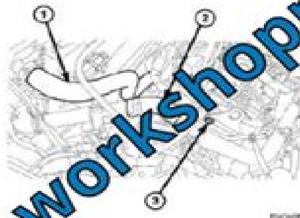
Fig. 8: Charge Air Cooler Hoses