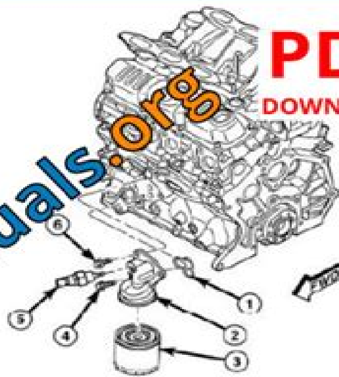
Fig. 156: Removing/Installing Oil Filter Adapter