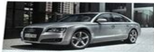
Quick Reference Guide 2014 Audi A8 L