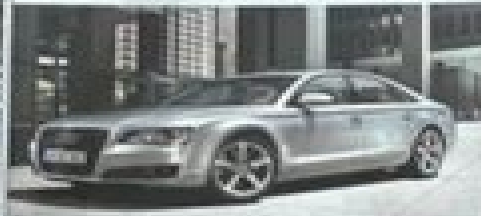
Owner's Manual 2014 Audi A8 L