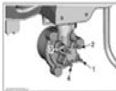
FIGURE 3 Oil injection pump hoses connection