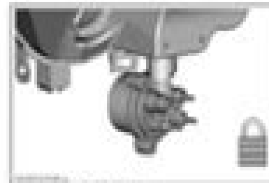
FIGURE 8 Oil injection pump removal

3. Rotate oil injection pump from 90 degrees as illustrated.