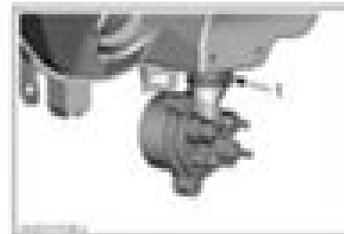
FIGURE 7 Oil injection pump removal

3. Rotate oil injection pump from 90 degrees as illustrated.