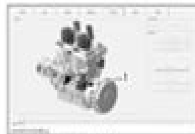
FIGURE 6 Oil injection pump test with B.U.D.S.

6. Listen if oil injection pump is activated.