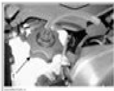
FIGURE 1 Oil injection pump

2. Connect the pressure pump to test tool.