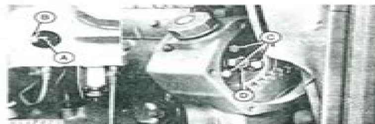
A—Drive Hub Mark B—Pointer Mark

5. If timing is correct, replace plugs and reconnect hose.