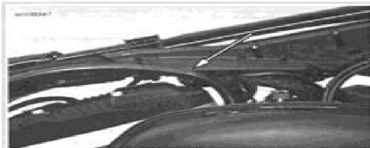
Figure 3-12. EVAP Purge Hose Barbed Cable Strap