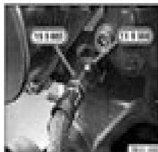
Fig. 127: Special Tool (1) (9.540) and (1) (9.545)

Check engine oil pressure with diagnostic tester.