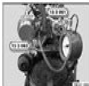
Fig. 128: Special Tool (1) (9.545) and (1) (9.545)