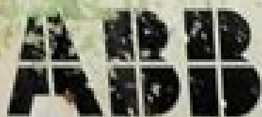
ABB Turbocharger ABB Turbo Systems Ltd