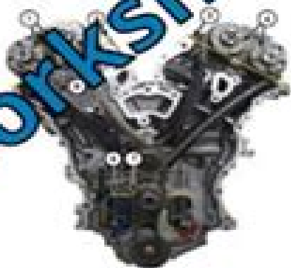
Fig 17: Surface Union, Valve Cover Sealing Surface, Valve Cover, Rocker Bearing Cap Junction & Cover

1. Clean and inspect the sealing surfaces, the gaskets may be reused if no issues are found. Install the lower intake manifold to cylinder head gaskets.