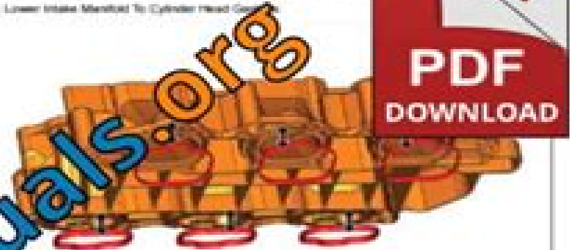
Fig 1: Lower Intake Manifold To Cylinder Head Cover

21. Install the engine cover. Refer to COVER, ENGINE, INSTALLATION.