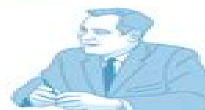
Joseph F. Sutter Designer of the 747 Series

The 747-400 is the most reliable aircraft in the world. It has the highest payload capacity, the highest cruise speed, and the highest ceiling of any aircraft in the world. It is the most efficient aircraft in the world, and the most comfortable.