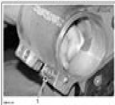
1. Insert a screw to retain seal in place.