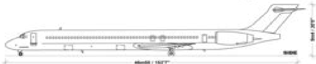
McDonnell Douglas MD90