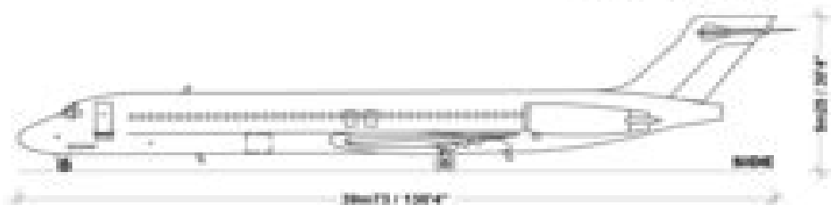
McDonnell Douglas MD87