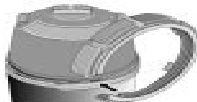
Figure 2 - Insert ring tab in slot in filter body.