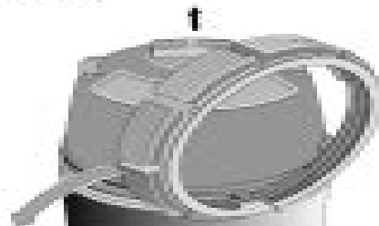
Figure 3 - Roll ring to one side to loosen upper tank half.