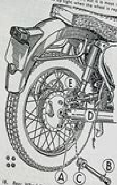
Fig. 18. Rear Wheel Removal and Rear Chain Adjustment.

To remove the rear wheel, place the machine on its stand. Take off the nut (A) Fig. 18, so free the brake anchor screw and disconnect the brake cable. Unscrew the four retaining nuts (B) Fig. 18, leaving the wheel on the chainwheel. On machines fitted with a fully enclosed chaincase, this operation is carried out after removing the rubber plug (C) Fig. 19. Then, place a spacer bar in the spindle end as (D) Fig. 18, and unscrew in an anticlockwise direction until it can be withdrawn. The spacer plate (E) can then be removed and the wheel can be withdrawn to the right, when it can be taken downwards and rearwards. Note that the large nut (A) Fig. 19, on the left-hand end of the spindle retains the chainwheel and should not be disturbed. Reassembly is carried out in the reverse order, but it is most important that the four retaining nuts are screwed up tight when the wheel is replaced.