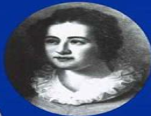
Ann Judson 1789-1826