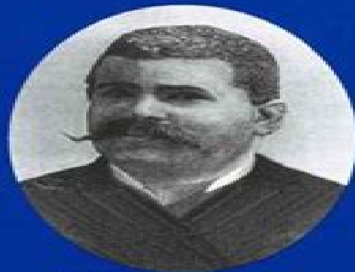
William J. Simmons 1849-1890