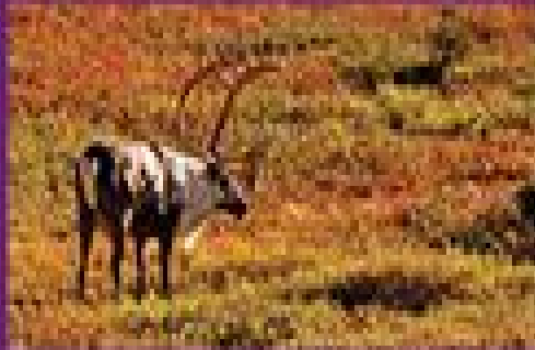
A Folding Pocket Guide to Familiar Animals & Plants of the Arctic & Subarctic Regions